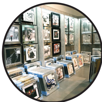
WALL ART /MIRRORS