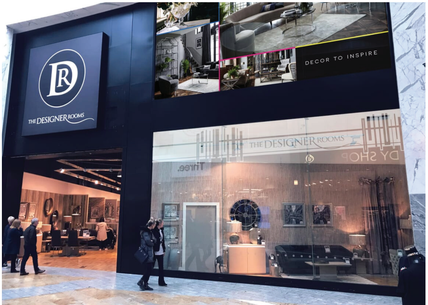
Silverburn Shopping Centre Glasgow Scotland, UK. Opened March 2019.