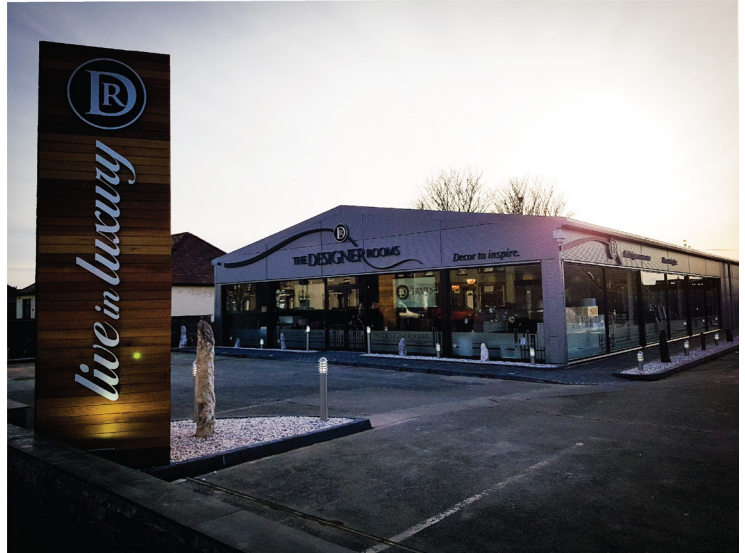
Irvine Showroom, West Coast of Scotland, UK. Opened March 2018.